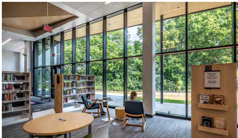
Left: Reading area facing patio Right: Exterior view of patio