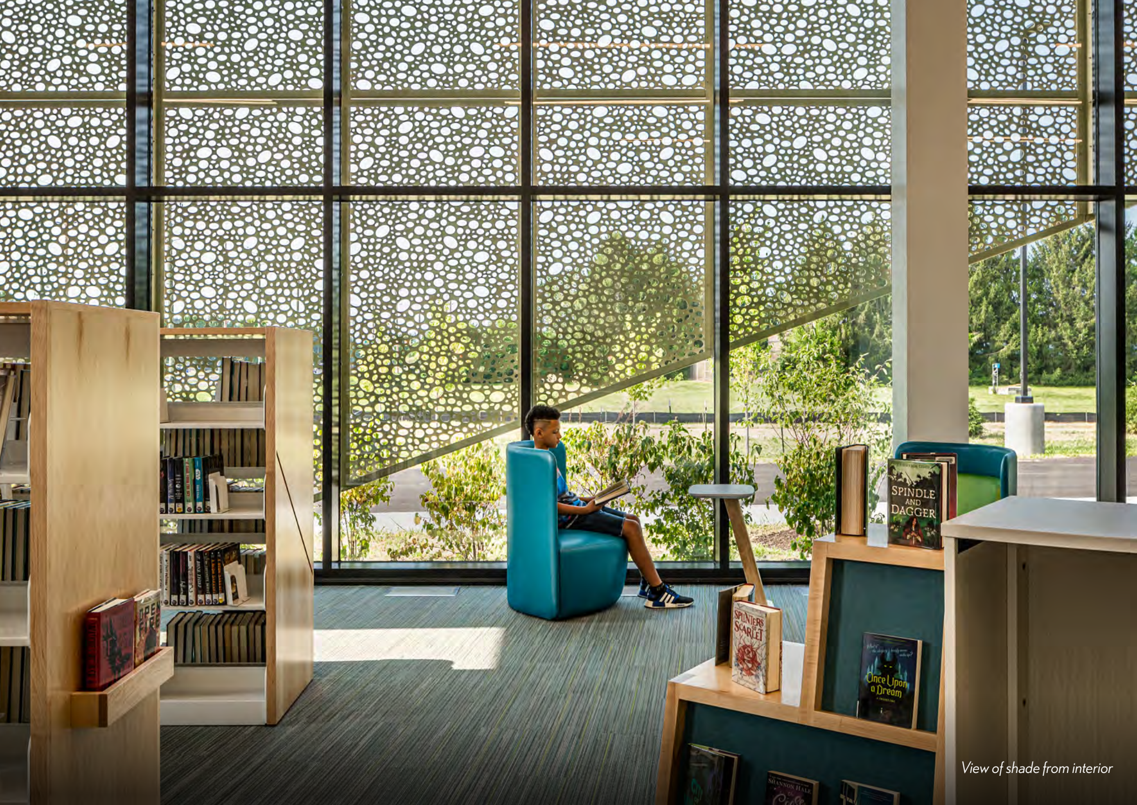
View of shade from interior