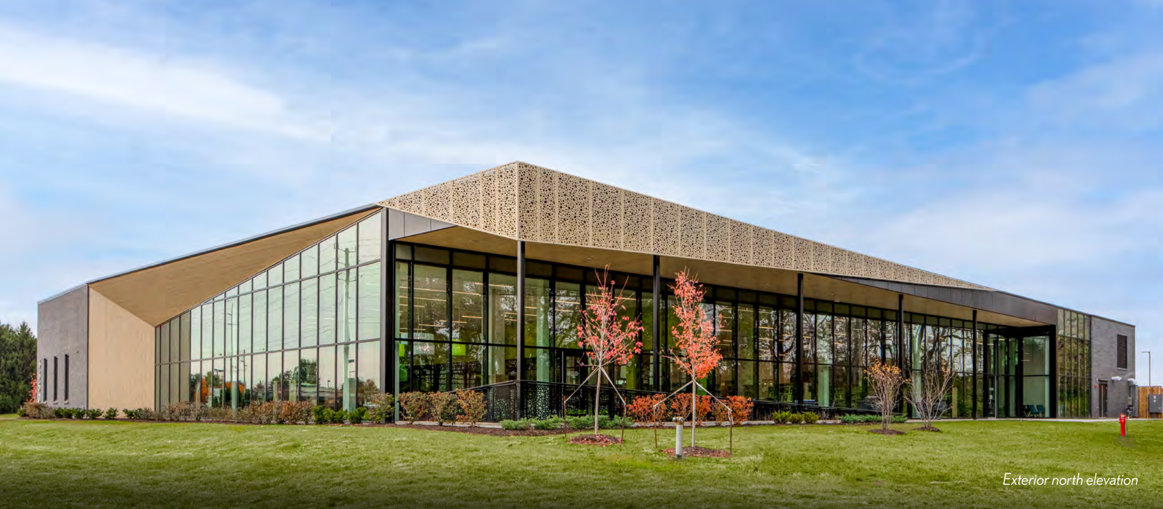
Exterior north elevation